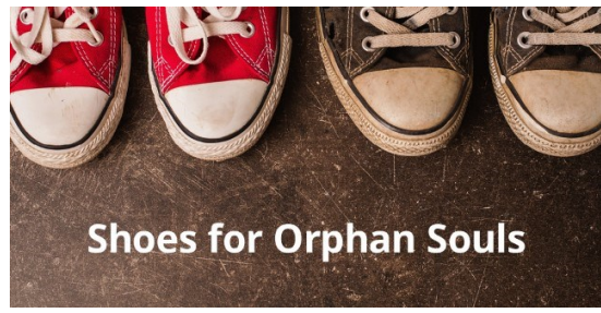
Shoes for Orphan Souls

August Shoes for Orphan Souls August 4 —Pastor & Preachers Fellowship, Baptist Center, 7:00 pm August 11 — Baptist Collegiate Week August 17 —Baptist and Reflector Day